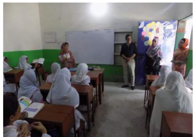
HDF Secondary School Karol War