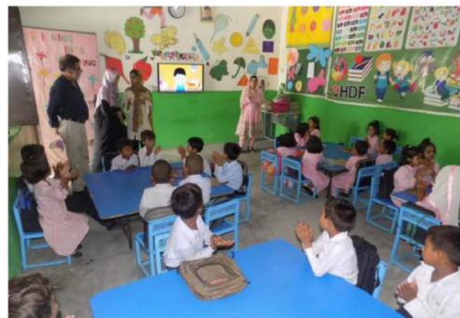
HDF Secondary School Ainu Bhatti

Next, a week later, we drove to Mardan to HDF Girls Secondary School Gurdas and HDF Girls Secondary School Mirwas. Both schools in Mardan region were impressive. The school premises were clean and well maintained. Management and faculty of the school appeared very professional from their appearance and conversation.