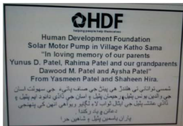
HDF Donor Plaque