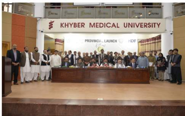
Umeed Say Aagay Awareness Campaign launches at Khyber Medical University