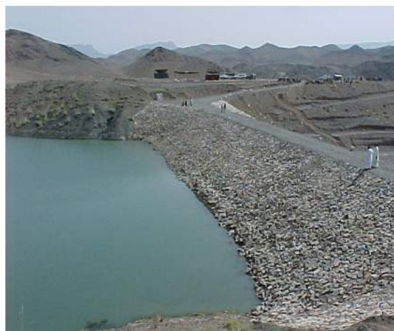
DAM Maroozfai, Zhob

Awareness sessions on the significance of water and its use are also conducted in HDF program areas. With the increasing water crisis, HDF has redoubled its efforts for efficient water management in communities across the country.