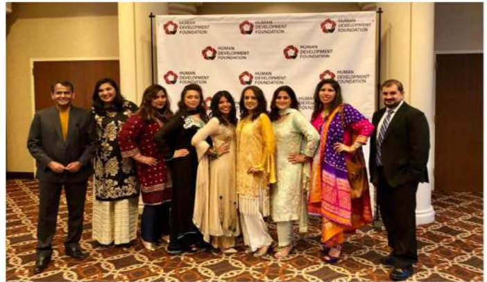
Washington DC Volunteer Network