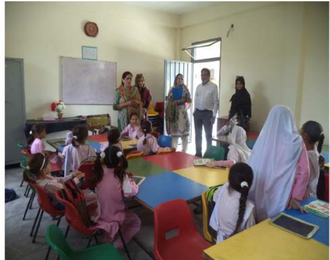
HDF Girls Secondary School Mirwas

Please contact our office at 847.490.0100 or email info@hdf.com