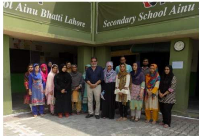
HDF Secondary School Ainu Bhatti

The school appeared as a sign of urban development amidst rural surroundings. With a purpose-built and well-maintained double story campus, cemented floor, and spacious classrooms, it was comparable to any uptown school. The classrooms were well-equipped with necessary supplies and some even had LCD screens that were used to show educational videos. The school's electricity needs were met by the Solar Power System, installed in the school premises. Most government schools even in the cities do not have all these facilities.