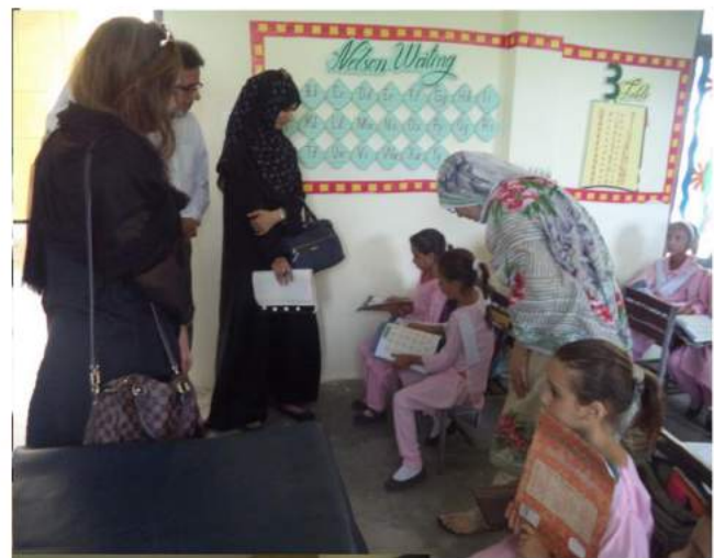
HDF Girls Secondary School Gurdas