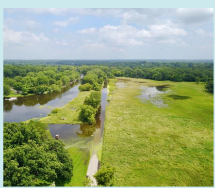
Whippoorwill Dr. – Bay View Beach