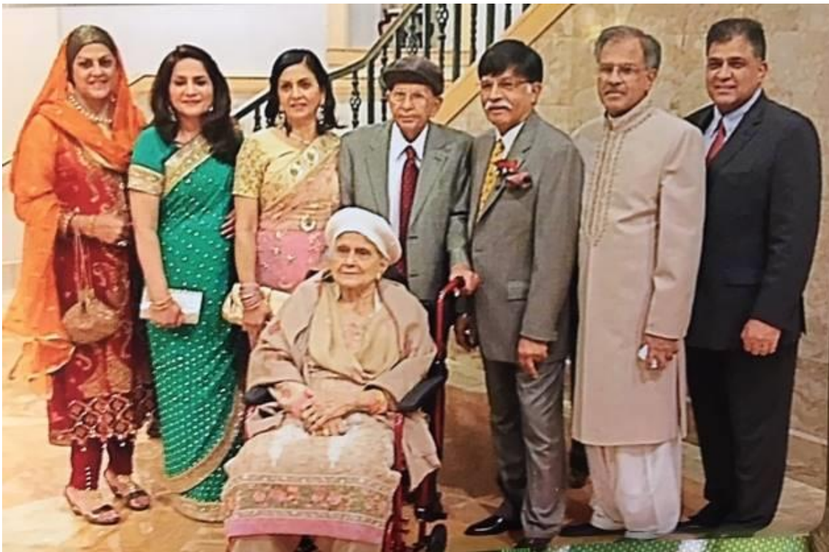
Children and Grandchildren