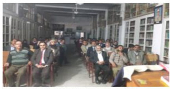
Guests, academic staff and students at the seminar