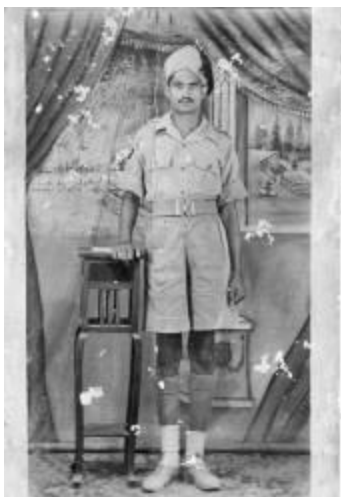
Shimla, Punjab 1945-6

Boys Primary School # 2 at Chak # 297 JB, Gojra, Pakistan