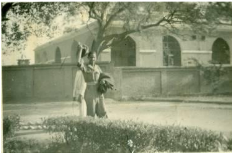
Army Medical Corps, Shimla