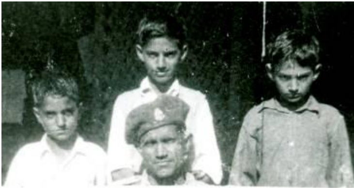
Rawal Pindi- 1956